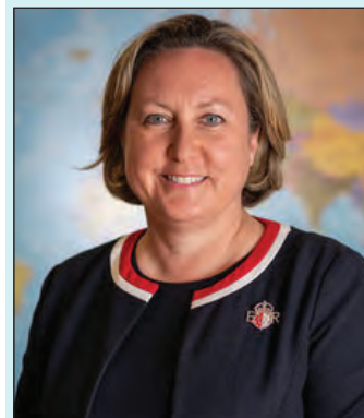
Anne-Marie Trevelyan MP

If you think you may have the virus (if you have a new, continuous cough or a fever) please stay at home for at least 7 days, and if you live with others, the whole household must stay home for 14 days. You should only call 111 if you cannot manage your symptoms without medical help. This is vital for those most at risk.