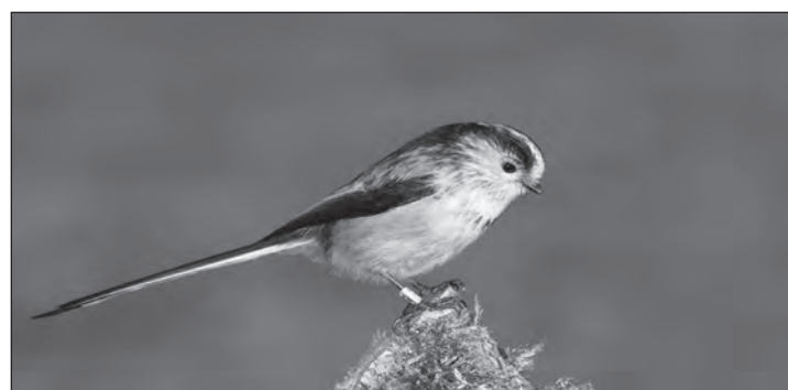
Long-tailed tit.

In line with the recent government announcement about Coronavirus and reducing social interaction, Northumberland Wildlife Trust are cancelling all Northumberland Wildlife Trust events and scheduled volunteer tasks for March and April 2020. Our cafés at Hauxley and Northumberlandia will be closed from Monday 23rd March. The visitors centre and reserve at Hauxley currently remains open but this is subject to change depending on what happens regarding current advice on the coronavirus.