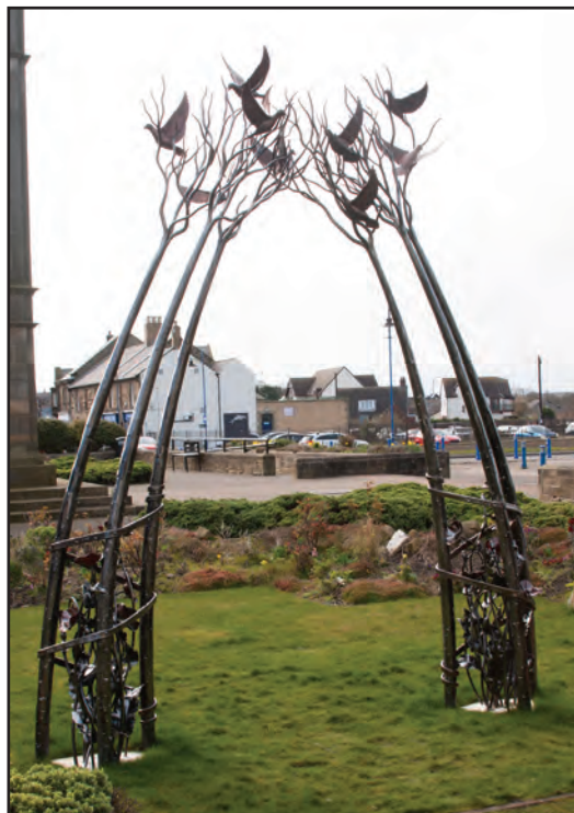
The peace sculpture by local blacksmith Steven Lunn will form part of the trail

It explains that the project will seek to support more than 60 businesses and create 30