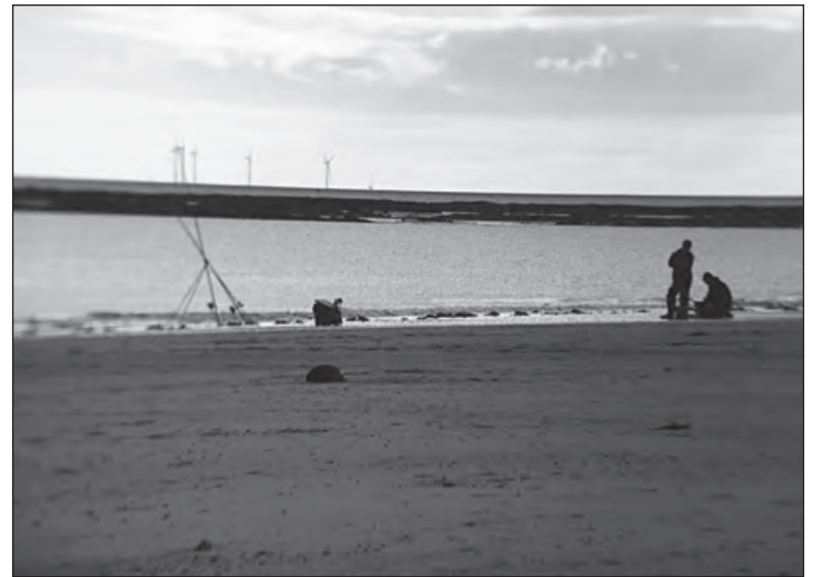
The Amble Sea Angling Open competition is one of the most popular in the country

Nick Weir Inshore Fisheries Conservation Officer