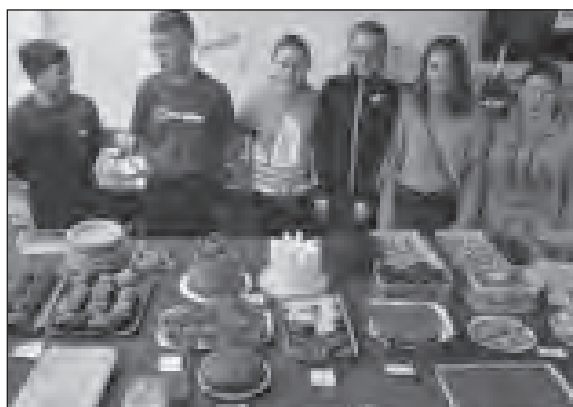
Young people raised money by baking and selling cakes