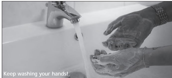
Keep washing your hands!

So we're asking you to tell us your positive stories, sing the