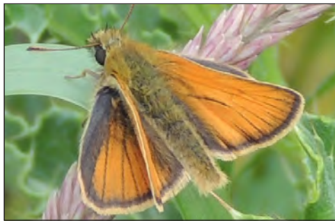
Small skipper butterfly.

The large grassland area surrounding Coquet Vets is a good example. The area used to be mown regularly but has remained untouched for the last couple of years allowing taller plants to colonise. Last year purple flowered knapweed, an important butterfly food plant, appeared in greater numbers in this area along with bright yellow common ragwort, a notifiable weed, unfairly so in my opinion, which is also favoured by many of our pollinators. These wild flowers, if allowed to flourish, could support a considerable insect population which in turn would support many insect eating birds