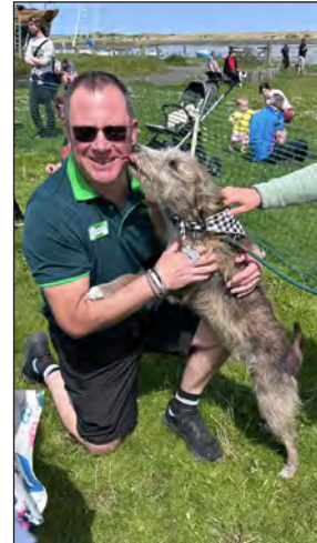
Above: Puffin Theatre Club, Best dog winner - Blue the Bedlington Whippet.