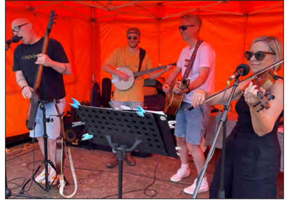
Above l-r: Caribbean Crew, Inglenook. See more on our website.